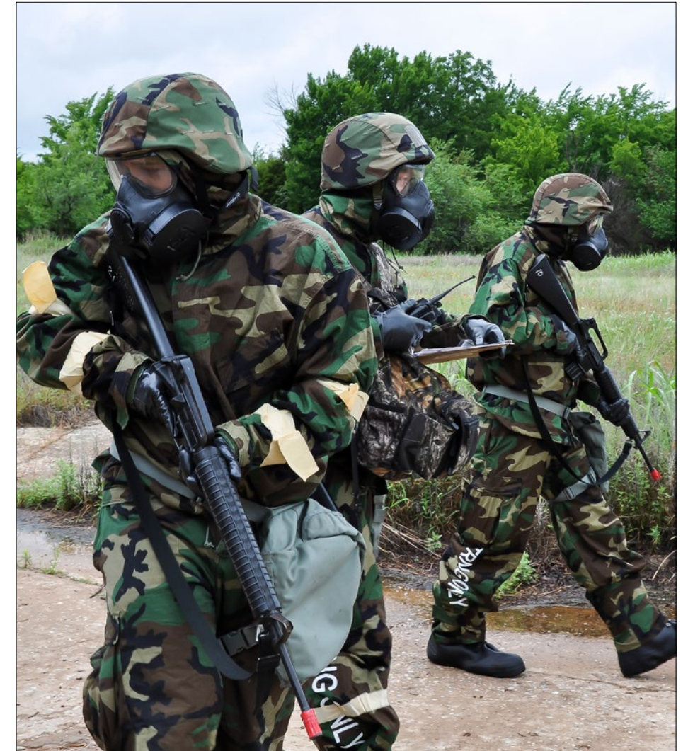
Members of the 507th Air Refueling Wing demonstrate the ability to survive under hostile conditions during the June Unit Training Assembly here. More than 70 members took part in the yearly exercise.

The chemical gear is solely for training to ensure safety in the real world environment, while the M50 field mask is used during real world chemical, biological, radiological,