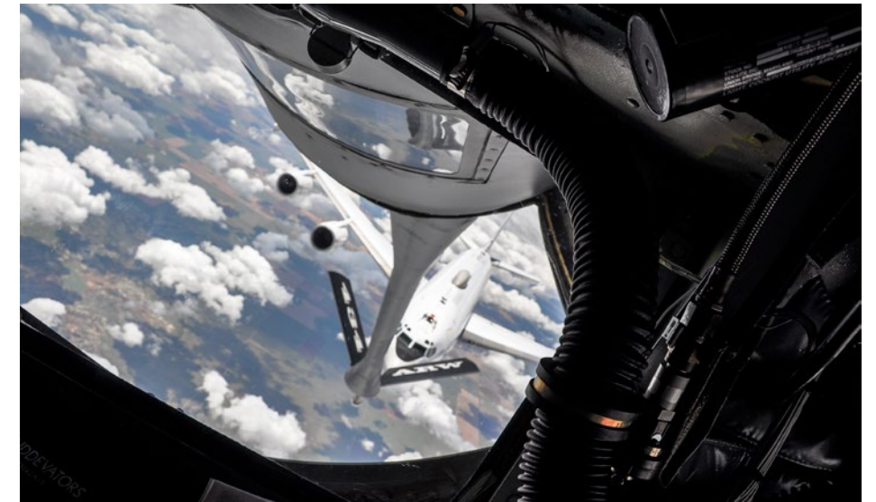
A U.S. Navy E-6 Mercury receives fuel from a KC-135R Stratotanker during an incentive flight June 6, 2014 at Tinker Air Force Base. The incentive flight gave Airmen from the 507th Air Refueling Wing the opportunity to see a refueling in person.

Before getting aboard the KC-135R, incentive flight recipients assembled in the 465th conference room for a briefing on safety features and procedures. The briefing included what to do in case of an emergency