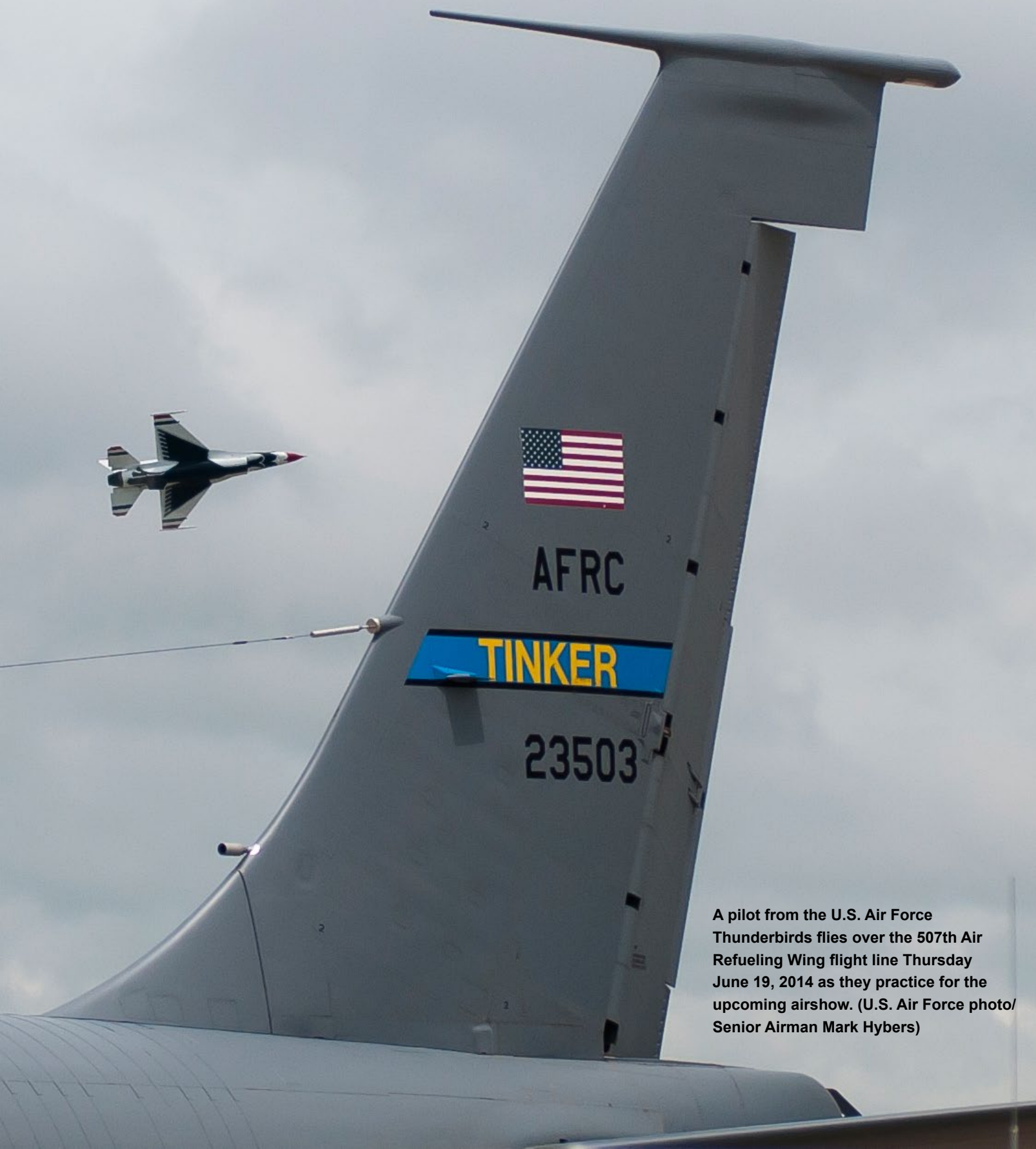
A pilot from the U.S. Air Force Thunderbirds flies over the 507th Air Refueling Wing flight line Thursday June 19, 2014 as they practice for the upcoming airshow.